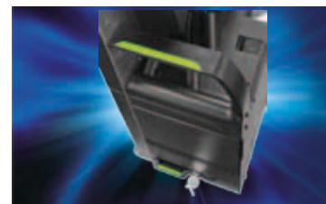
Locking cash door