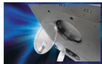
Easy access doors