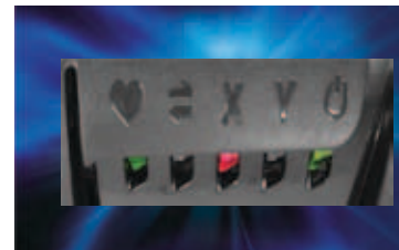
LED status indicators